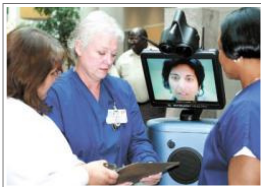
(ENLARGE)